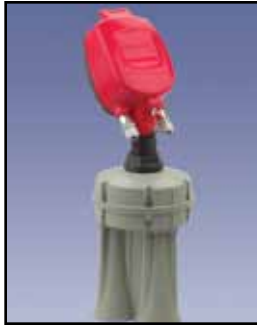
3DLevelScanner Non-Contact Sensor