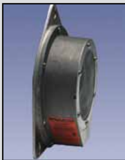
BM-65 Diaphragm Switch

Switch Ratings: 15 Amps @125, 250 or 480 VAC, 1/8 HP @ 125 VAC, 1/4 HP @ 250 VAC, 1/2 Amp @ 125 VDC, 1/4 Amp @ 250 VDC Operating Temp: -40°F to +300°F (-40°C to +149°C) Housing Enclosure: Die cast aluminum Mounting: Internal or external, 16 gauge galvanized mounting plate