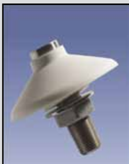
Airbrator Aeration & Vibration

Input Voltage: 115 VAC ± 10%, 50/60 Hz, 3 VA, 230 VAC ± 10%, 50/60 Hz, 3 VA, 24-48 VDC, 2 W maximum Relay: SPDT, 2 Amp 240 VAC Enclosure: NEMA 4X Operating Temp: -4°F to +158°F (-20°C to +70°C) Warranty: One year