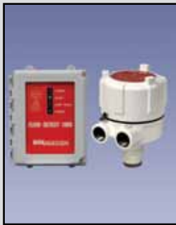
Flow Detect 1000 Microwave Flow Detection

Preferred Applications: Powders and solids Measuring Range: 200 feet (61 meters) Supply Voltage: 20 - 32 VDC Process Temp: -40°F to 185°F (-40°C to 85°C) Process Pressure: -0.2 - 1bar (-2.9 to 14.5 psi) Signal Output: 4-wire 4-20mA/HART/RS-485/Modbus Emitting Frequency: 3 KHz to 10 KHz Housing: Aluminum die cast powder coated Approval: ATEX II 1/2D, 2D, Ex ibD/iaD 20/21 T110°C, ATEX II 2G Ex ia/ib IIB T4, FM Intrinsically Safe Class I, II, Division I, Groups C, D, E, F, G