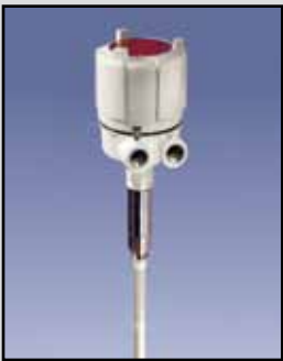
PROCAP IX & IIX Capacitance Probe

PROCAP I Power Requirements: Universal power supply 24 to 240 VAC/VDC PROCAP II Power Requirements: Selectable 115/230 VAC Output Relay: DPDT 10 Amp at 250 VAC Ambient Temp: -40°F to +185°F (-40°C to +85°C) Process Temp: To 250°F Delrin/Bare probe (121°C); to 500°F Teflon probe (260°C) Pressure: 500 PSI Approvals & Certifications: Listed for Class II, Groups E, F & G Hazardous Locations Enclosure Type: NEMA 4X, 5, 9 & 12 Housing Enclosure: Die cast aluminum, USDA approved powder coat finish Mounting: 1-1/4" NPT or 3/4" NPT 316 SS standard; 1-1/4" NPT 316 SS & sanitary flange optional