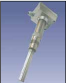
SHT-120/140 Vibrating Rod

Power Requirements: Wide range 20-250V AC/DC Power Consumption: 3 VA Relay: SPDT 5A 250 VAC Time Delay: 1 second from stop of vibration, 2 to 5 seconds for start of vibration Ambient Temp: -4°F to +150°F (-40°C to +65°C) Process Temp: To 176°F standard (80°C); to 300°F high temp (150°C) Pressure: 145 psi Wiring Cable: 1/2" Mounting: 1" NPT Enclosure: Die cast aluminum, NEMA 4, 5 & 12 Probe: 304 stainless steel, 6" insertion length Material Density: From 3.5 lb./cu. ft.