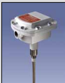
PRO AUTO CAL Capacitance Probe

Power Requirements: 115/230 VAC, 50/60 Hz \pm 15\% , 5 VA Output Relay: DPDT 10 Amp at 250 VAC Ambient Temp: -40^{\circ}\text{F} to +185^{\circ}\text{F} ( -40^{\circ}\text{C} to +85^{\circ}\text{C} ) Process Temp: To 250^{\circ}\text{F} Delrin probe ( 121^{\circ}\text{C} ); to 500^{\circ}\text{F} Teflon probe ( 260^{\circ}\text{C} ) Pressure: 500 PSI Approvals & Certifications: CSA Listed, Intrinsically Safe Class I, NEMA 4X, 5 & 12 Probe Enclosure: Die cast aluminum, USDA approved powder coat finish Electronic Enclosure: Polycarbonate or aluminum Mounting: 1-1/4" NPT or 3/4" NPT 316 stainless steel Standard: 1-1/4" NPT 316 stainless steel & sanitary flange optional