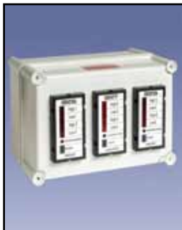
Point Level Alarm Panel

Switch Ratings: 15 Amps @125 or 250, 1/8 HP @ 125 VAC, 1/4 HP @ 250 VAC, 1/2 Amp @ 125 VDC, 1/4 Amp @ 250 VDC Operating Temp: -40°F to +300°F (-40°C to +149°C) Approvals & Certifications: Listed for Class II, Groups E, F & G Hazardous Locations Enclosure Type: NEMA 4, 5, 9 & 12 Housing Enclosure: Die cast aluminum Mounting: Internal or external, 16 gauge galvanized mounting plate